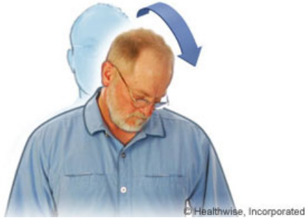
slide 2 of 5, Diagonal neck stretch,