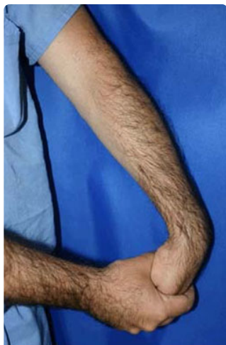
Wrist stretching exercise with elbow extended.

Physical therapy. Specific exercises are helpful for strengthening the muscles of the forearm. Your therapist may also perform ultrasound, ice massage, or muscle-stimulating techniques to improve muscle healing.