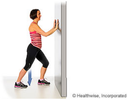
slide 2 of 7, Calf wall stretch (knees bent),