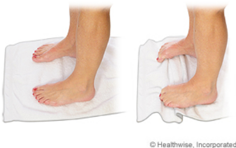
slide 4 of 7, Towel scrunches,