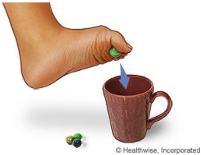
slide 3 of 7, Marble pick-ups,