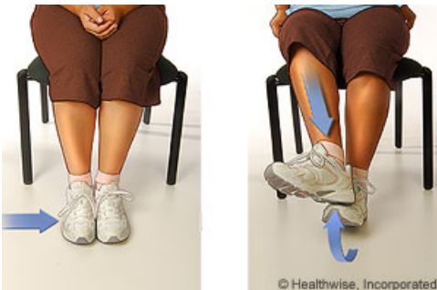
slide 6 of 10, Isometric opposition exercises,