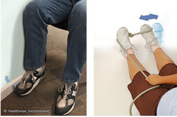
slide 5 of 10, Ankle eversion exercise,