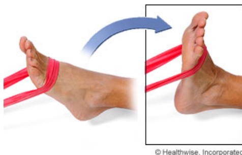
slide 9 of 10, Resisted ankle dorsiflexion,