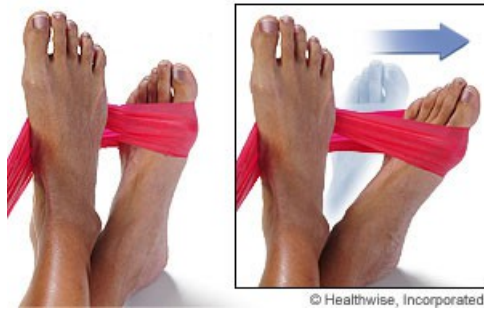
slide 7 of 10, Resisted ankle inversion,