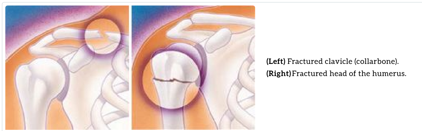
(Left) Fractured clavicle (collarbone). (Right) Fractured head of the humerus.